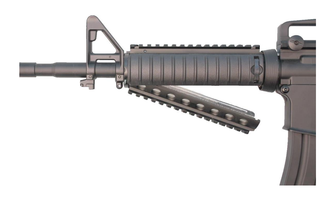
Step 2: Lock the grenade launcher at the outer barrel.