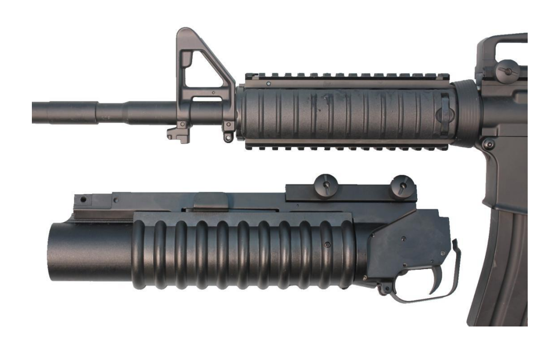
Step 2: Lock the grenade launcher at the lower hand guard